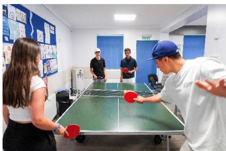
Table Tennis (free)

Play indoor golf in one of two locations, each a unique golfing experience, to be enjoyed by all ages. Both locations are open all week with discounts available when booking through WA.